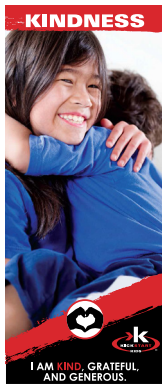
(8) Values Posters