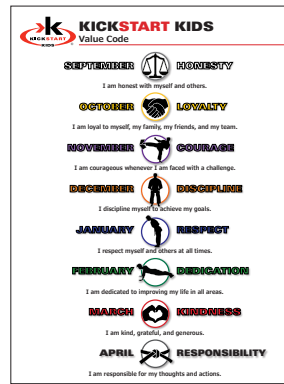
KSK Value Code